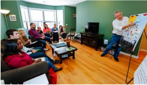
Photo: Energy Party outreach in a single family home.